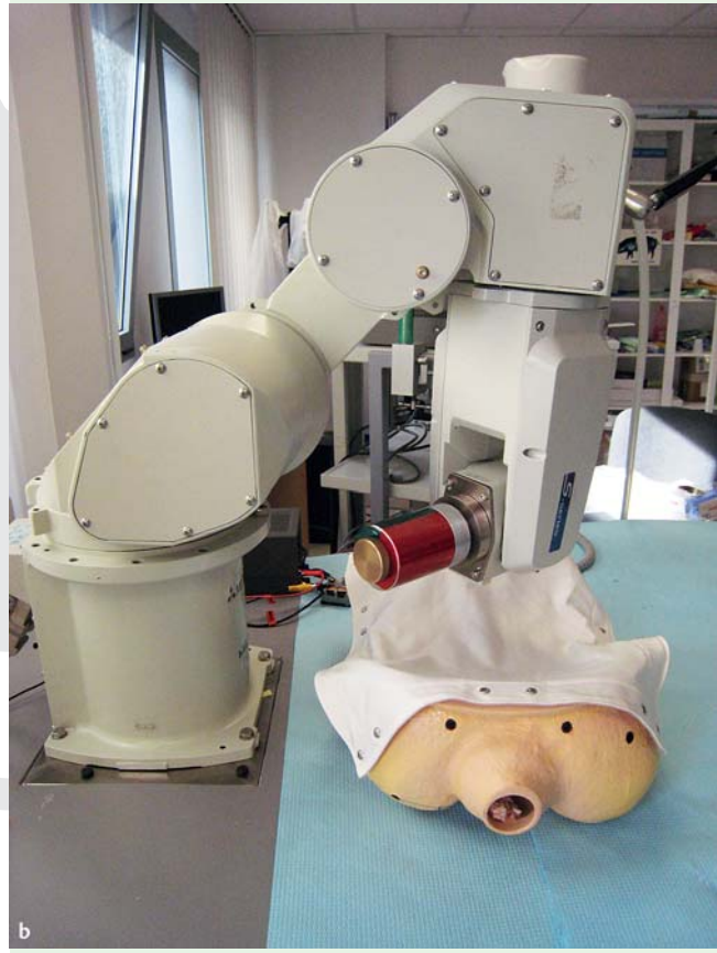
Fig. 3 Movement of the external permanent magnet during the procedure. a Manual control; b robotic control. The colon simulator was covered by a dedicated layer in order to avoid a bias due to direct vision of the capsule inside the lower gastrointestinal simulator.