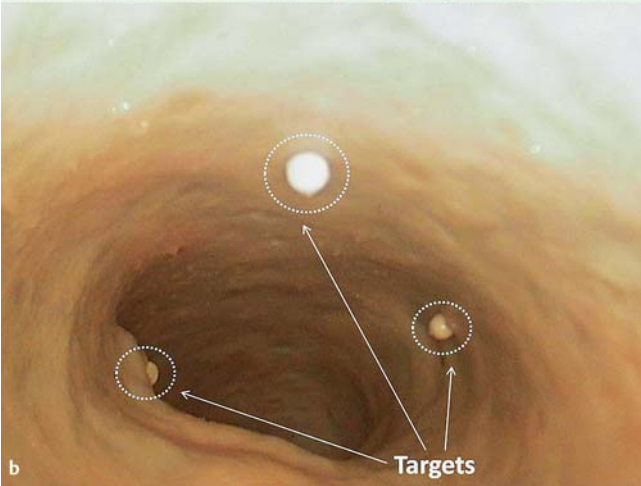
Fig. 2 The lower gastrointestinal phantom model. a Colon tissue fixed inside the model. b Internal view of colon tissue with white spherical targets installed on the wall.

target quantity and locations. In order to avoid a bias due to direct vision of the capsule inside the simulator, the phantom model was covered by a dedicated layer. All trials were observed by an assistant to ensure that targets were counted accurately (i.e. targets reached more than once were counted as one target). The quantity and position of targets on the inner wall of the colon were changed between trials by the assistant.