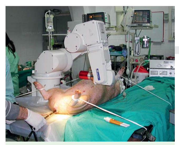
Fig. 4 Test bench for magnetic capsule steering with the aid of a robotic arm in in vivo conditions.

After intravenous sedation of each animal and preparation of the bowel by water enemas, the experimental procedure was performed maintaining 2 mmHg constant pressure inside the colon. The capsule was inserted transanally up to 300 mm in the bowels. For each trial, movements were performed both with and against peristaltic force within a range of \pm 100 mm from the starting position. Steering maneuvers were also completed, while keeping the capsule position stationary. The operator used streaming real-time video from the capsule, displayed on the HMI as control feedback. At the end of each trial, the capsule was magnetically driven down to the anus.